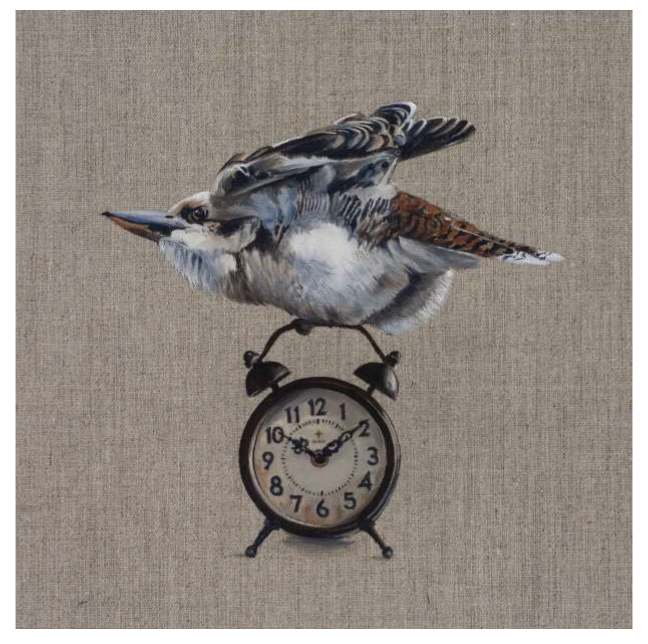
'I like the sound the sound they make' Kookaburra Vintage Alarm Clock 2 25 x 25 cm oil on linen panel