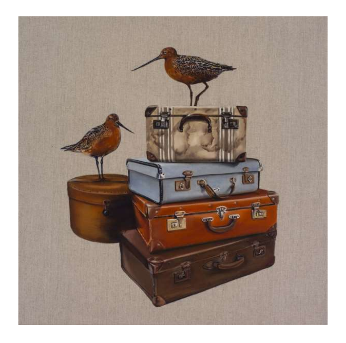
'Travel is our life and we love these so much' Bartailed Godwit Vintage Suitcases 2015 66 x 66 cm oil on linen