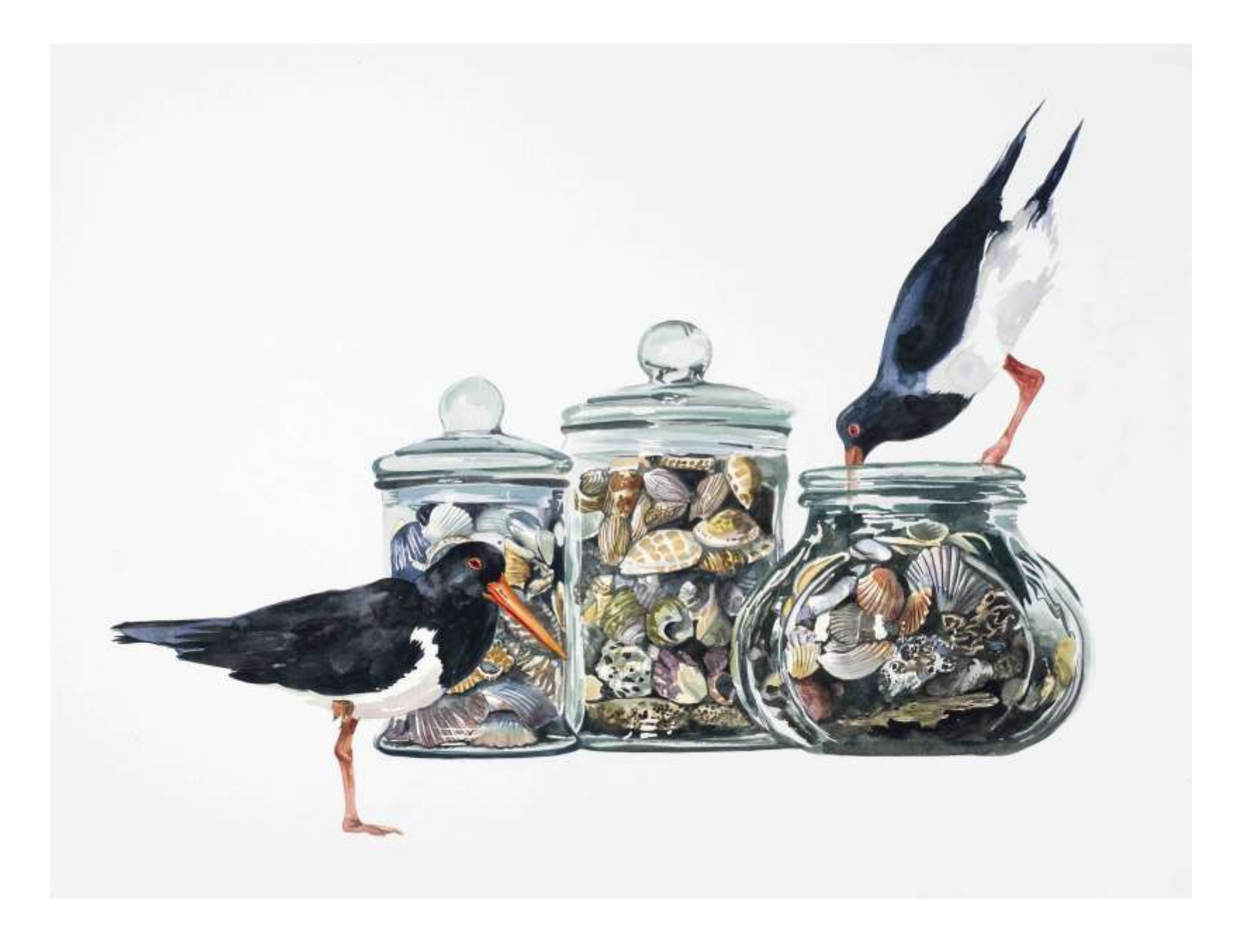
'We're not sure how we feel about taking them' Pied Oystercatcher Shells 2015 46 x 61 cm watercolour