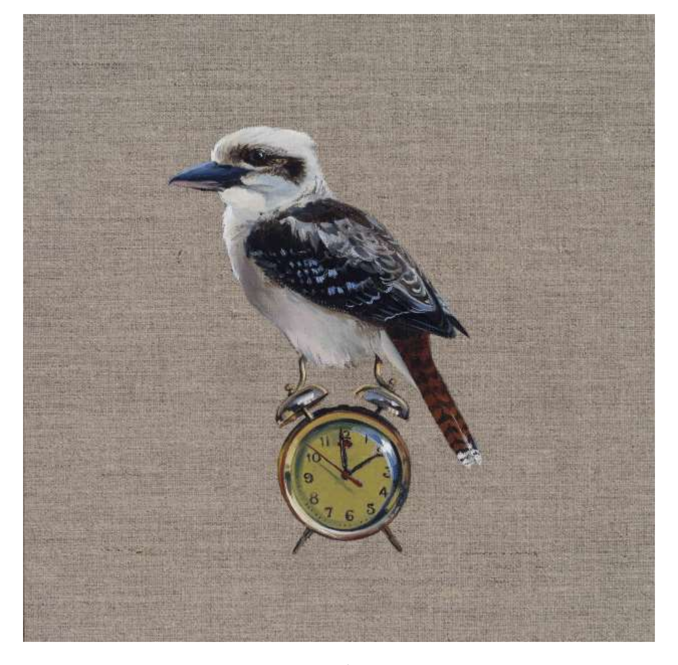
'I like the sound the sound they make' Kookaburra Vintage Alarm Clock 3 25 x 25 cm oil on linen panel