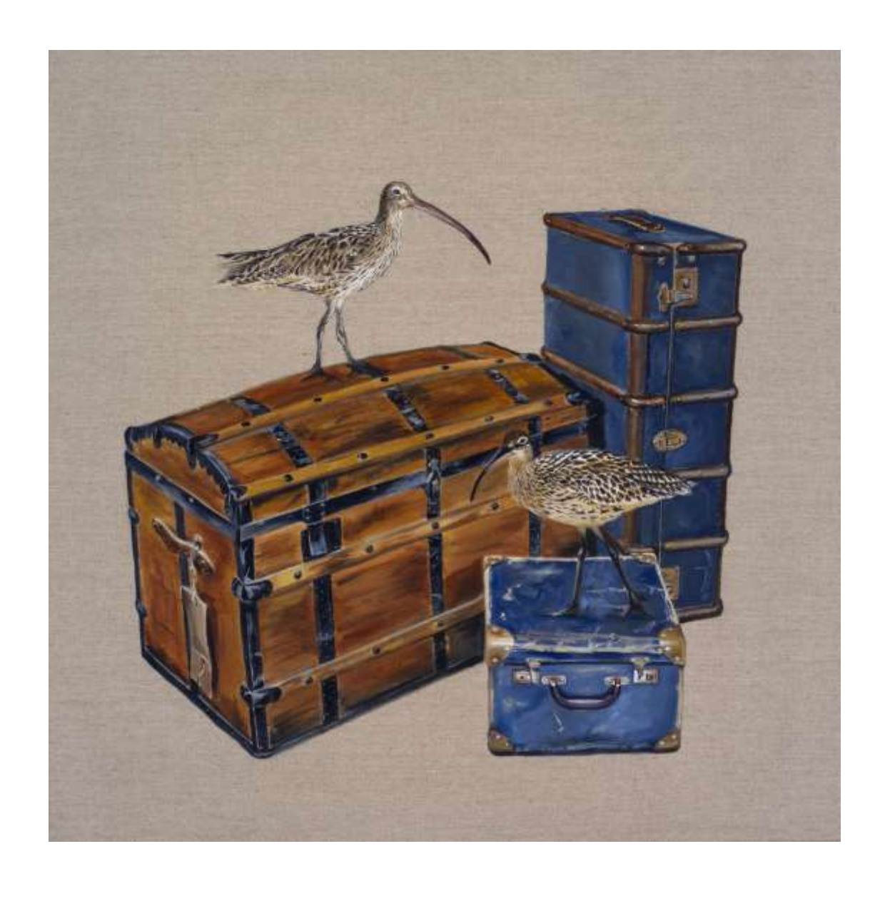
'These belonged to my grandmother' Eastern Curlew Travel trunks 66 x 66 cm oil on linen