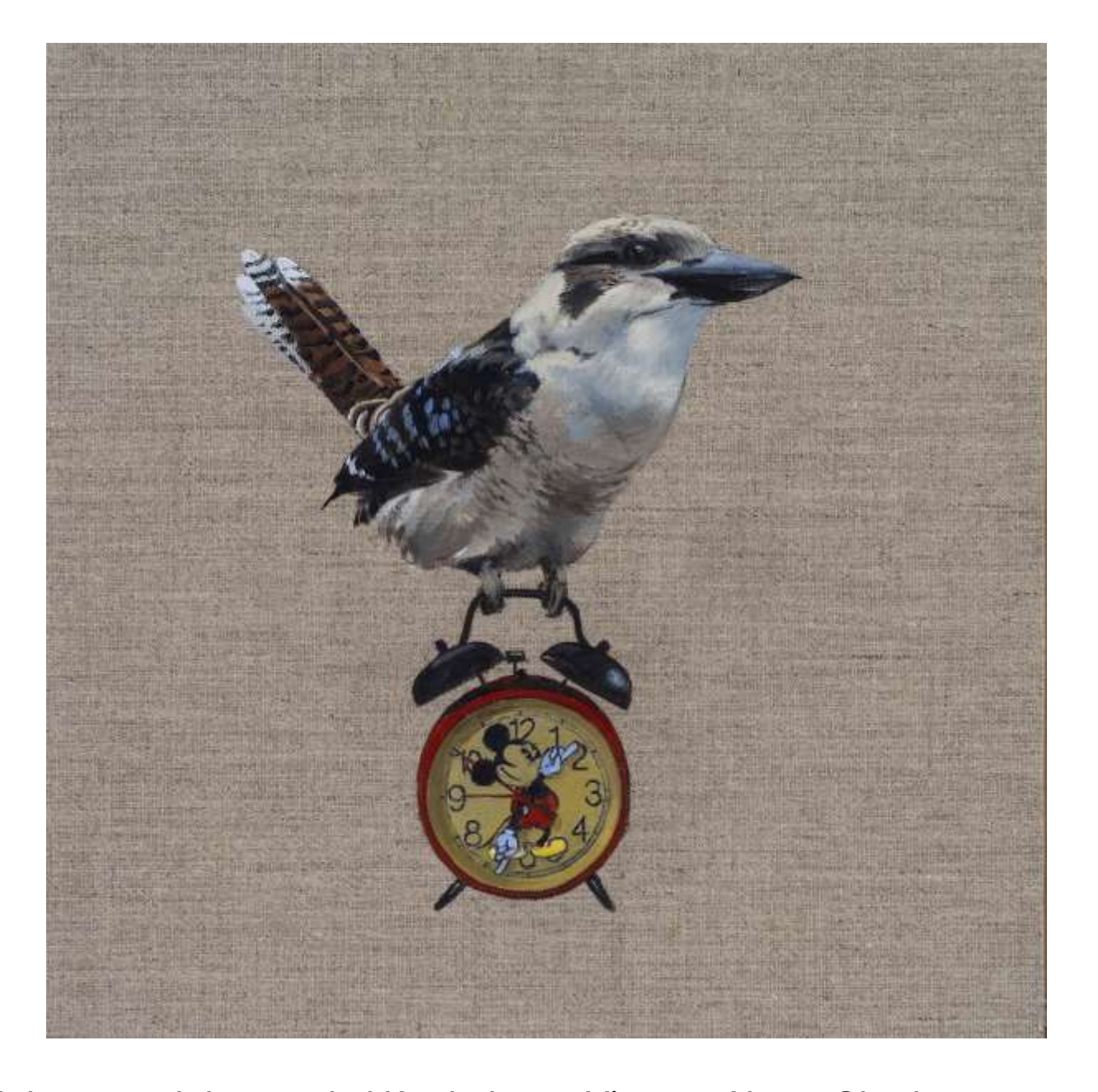
'I like the sound the sound they make' Kookaburra Vintage Alarm Clock 1 25 x 25 cm oil on linen panel