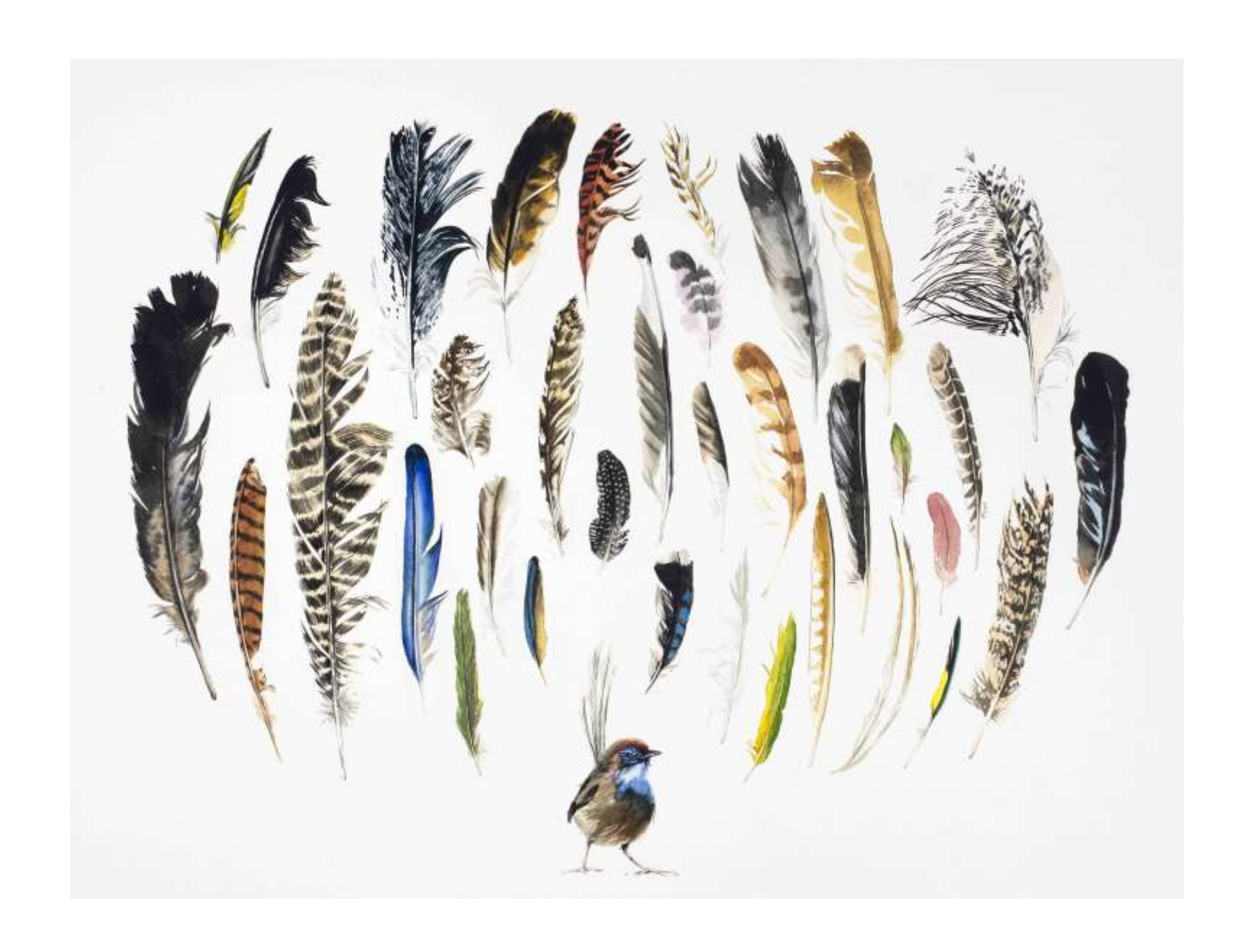
'I've always wanted nicer ones than I've got' Emu Wren Assorted Feathers 61 x 46 cm watercolour